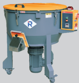
Rm立式混料机 RM vertical mixers