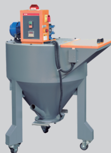
RSM小型螺旋混料机 RSM smaller spiral mixers