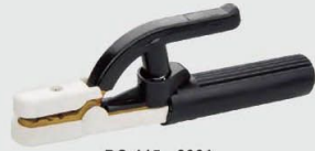
DC-115 300A G.W/N.W(kgs):20/18 QTY:50pcs MEAS:44X38X26 cm