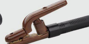
DC-105 300A G.W/N.W(kgs):14/13 QTY:30pcs MEAS:45X26X28.5cm