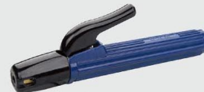
DC-107 500A G.W/N.W(kgs):20/18 QTY:25pcs MEAS:45X23X31cm