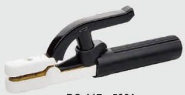
DC-117 500A G.W/N.W(kgs):22/20 QTY:50pcs MEAS:47X38X27cm