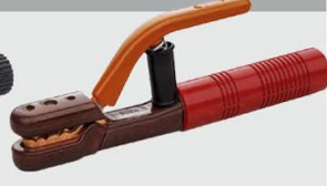
DC-112C 500A G.W/N.W(kgs):28/26 QTY:50pcs MEAS:50X39X28cm