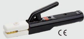
DC-101 500A G.W/N.W(kgs):22/20 QTY:50pcs MEAS:46X38X27cm