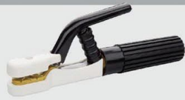
DC-110B 500A G.W/N.W(kgs):22/20 QTY:50pcs MEAS:49X37X27cm