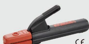
DC-118A 200A G.W/N.W(kgs):18/16 QTY:50pcs MEAS:46X36X25 cm