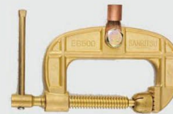
DC-217 500A G.W/N.W(kgs):23/11 QTY:50pcs MEAS:56X18X21 cm