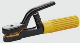
DC-110Y 500A G.W/N.W(kgs):22/20 QTY:50pcs MEAS:49X37X27cm