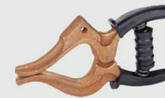
DC-205 300A G.W/N.W(kgs):20/19 QTY: 50pcs MEAS:49X26X22 cm