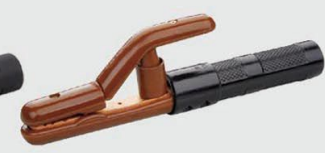
DC-106A 800A G.W/N.W(kgs):23/21 QTY:30pcs MEAS:46X31X35cm