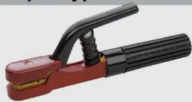
DC-110 500A G.W/N.W(kgs):22/20 QTY:50pcs MEAS:49X37X27cm