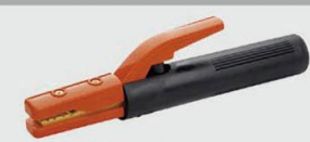
DC-108 500A G.W/N.W(kgs):20/18 QTY:30pcs MEAS:45X27X29cm