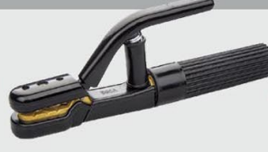
DC-111 500A G.W/N.W(kgs):28/26 QTY:50pcs MEAS:50X39X28cm