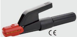
DC-118 500A G.W/N.W(kgs):24/22 QTY:50pcs MEAS:52X42X29cm