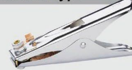
DC-206 500A G.W/N.W(kgs):18/16 QTY:50pcs MEAS:50X43X23.5 cm