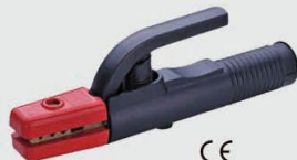
DC-119B 200A G.W/N.W(kgs):20/18 QTY:50pcs MEAS:48X37X25 cm