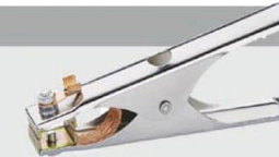
DC-205 300A G.W/N.W(kgs):18/16 QTY:100pcs MEAS:64X39X19 cm