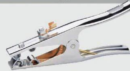
DC-202 500A G.W/N.W(kgs):22/20 QTY:50pcs MEAS:58X36X26 cm