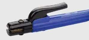
DC-113 300A G.W/N.W(kgs):22/20 QTY:50pcs MEAS:46X36X25cm