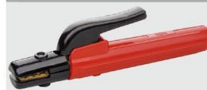
DC-114 500A G.W/N.W(kgs):24/22 QTY:50pcs MEAS:44X41X28cm