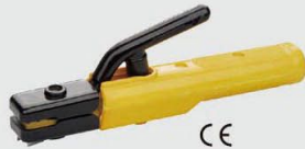
DC-102B 600A G.W/N.W(kgs):17/16 QTY:25pcs MEAS:45X22X27cm