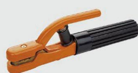
DC-110C 300A G.W/N.W(kgs):20/18 QTY:50pcs MEAS:46X36X25cm