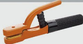
DC-110C 500A G.W/N.W(kgs):22/20 QTY:50pcs MEAS:49X37X27cm