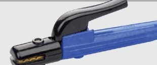
DC-114A 500A G.W/N.W(kgs):24/22 QTY:30pcs MEAS:44X41X28cm