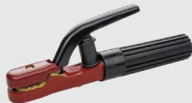
DC-109 300A G.W/N.W(kgs):20/18 QTY:50pcs MEAS:46X36X25cm