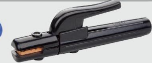
DC-114C 500A G.W/N.W(kgs):24/22 QTY:30pcs MEAS:44X41X28cm