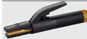
DC-108A 500A G.W/N.W(kgs):20/18 QTY:30pcs MEAS:45X27X29cm