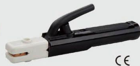
DC-102A 800A G.W/N.W(kgs):19/17 QTY:25pcs MEAS:52X23X29 cm