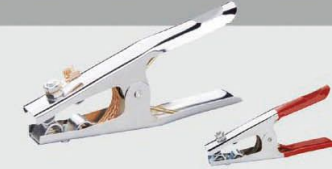
DC-203 300A G.W/N.W(kgs):15/13 QTY:50pcs MEAS:55X33X23.5 cm