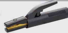
DC-108D 500A G.W/N.W(kgs):20/18 QTY:30pcs MEAS:45X27X29cm