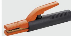
DC-107 300A G.W/N.W(kgs):14/13 QTY:30pcs MEAS:45X26X28.5cm