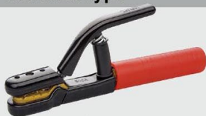
DC-112 500A G.W/N.W(kgs):28/26 QTY:50pcs MEAS:50X39X28cm