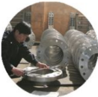
◆ 6. Products inspection