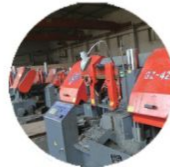
◆ 2. Cutting