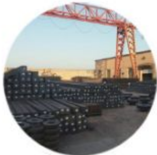
◆ 1. Raw material recheck