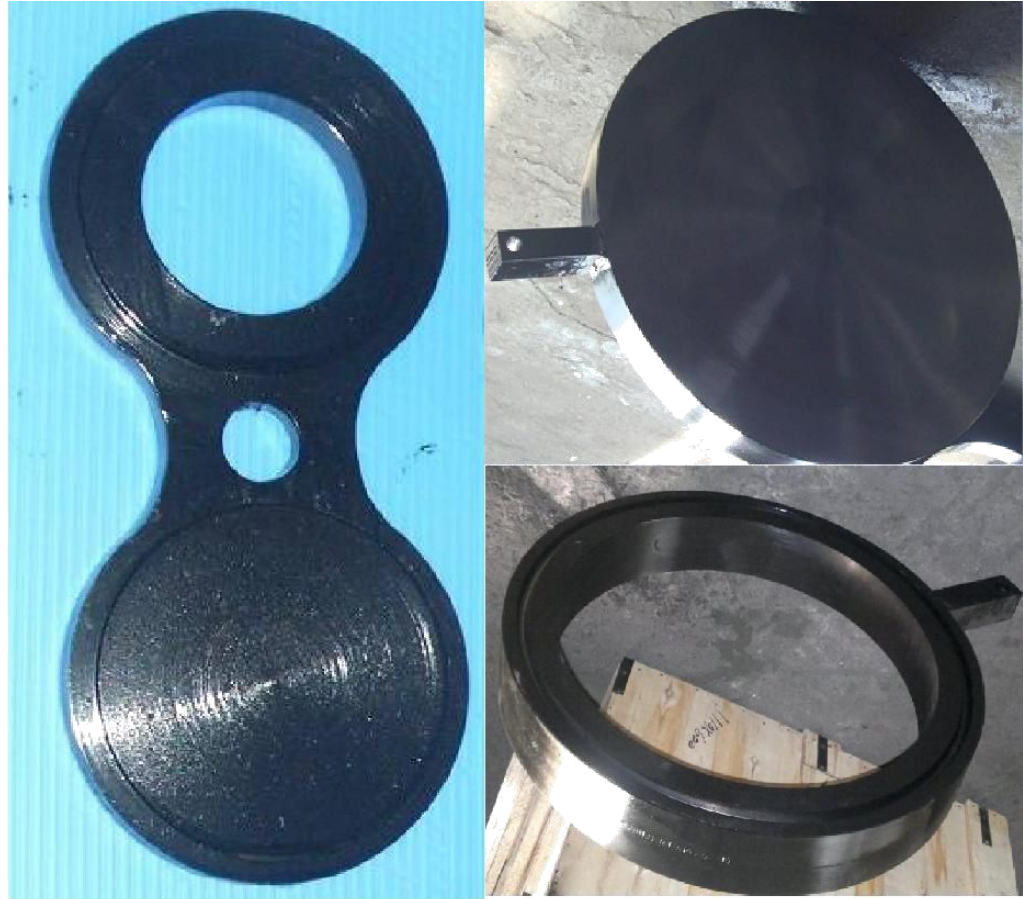
Spectacle Blind, Spade & Spacer