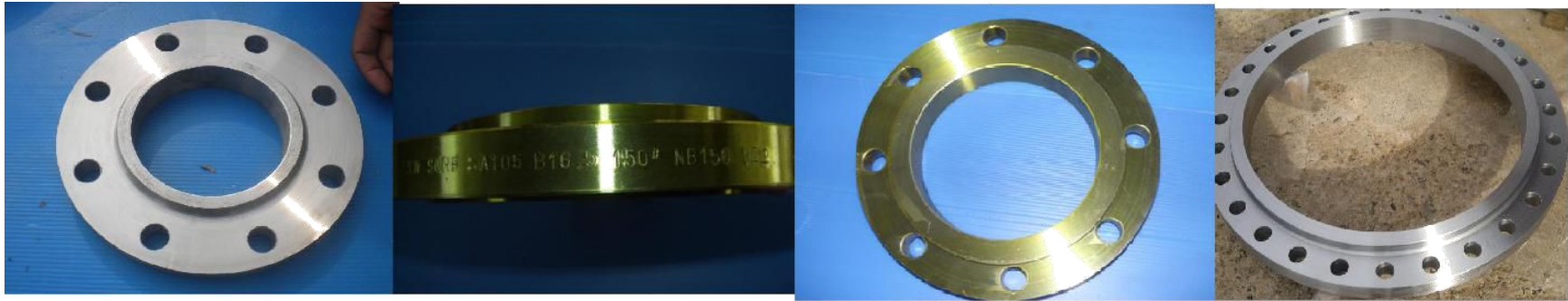
Slip on Flange