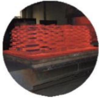
◆ 4. Heat treatment