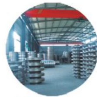
◆ 8. Storage