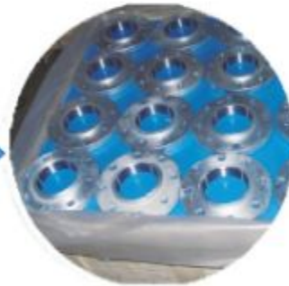
◆ 7. Painting and packing