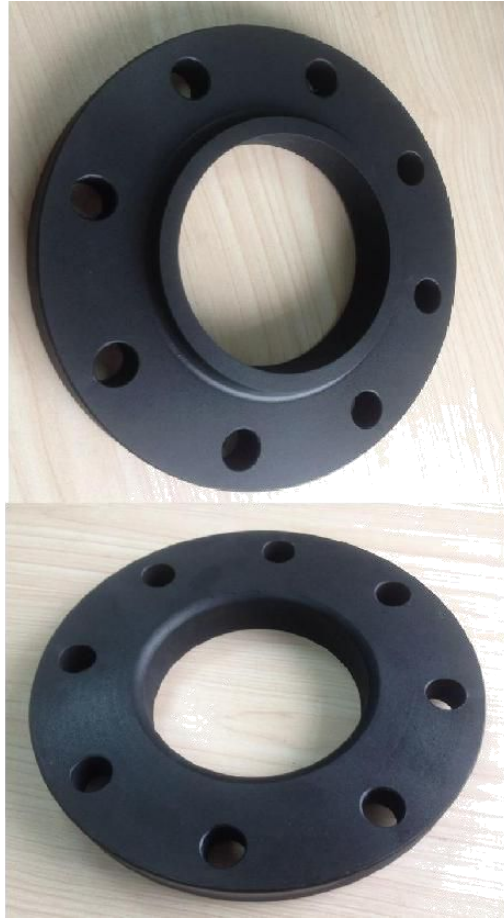
Lap Joint Flange