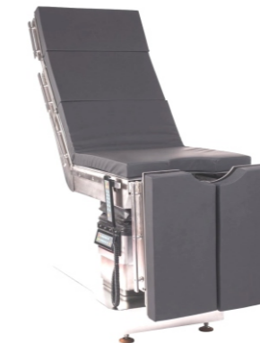
One Button Chair Position