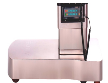
Electric Hydraulic Brake System