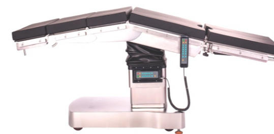
Flex 220° Kidney Position 120mm