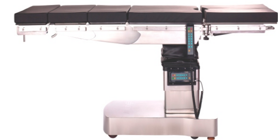
Longitudinal Slide 300mm