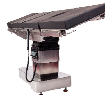
Left Lean/ Tilt 20°