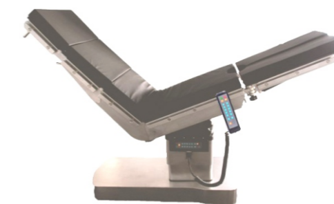
Reverse Flex 110°