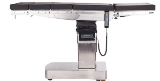
Maximum Height: 1000mm