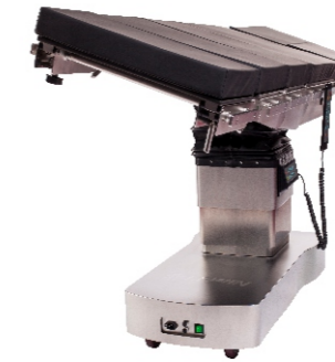
Right Lean/ Tilt 20°