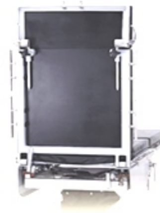
Back section for X-Ray cassette holding