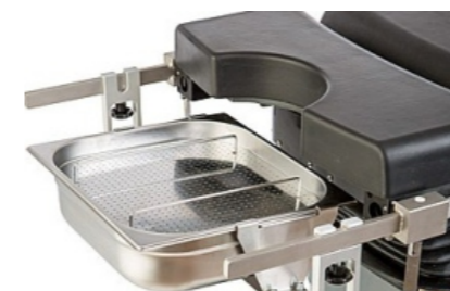
Urological extender/ adapter with drainage tray to extend seat section more than 30 cm