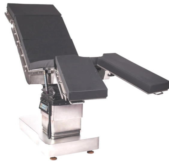
Split Leg Section