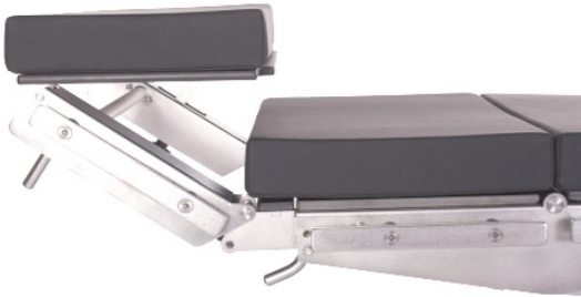
Head Section up Pillow position up to 90°