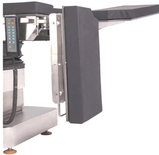
Leg Section Down 90° & Split apart 180°