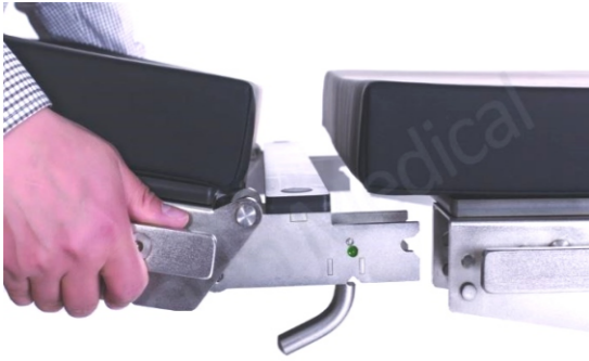
Head & Leg Section are detachable & interchangeable