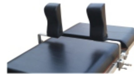
Anti static shoulder support with bar and SS clamps