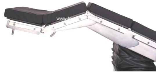
Head Section Down