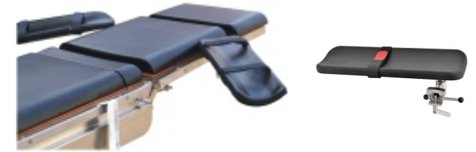
Anaesthesia arm board with ss clamp, wrist strap having 360° rotation & tilting 30° both sides