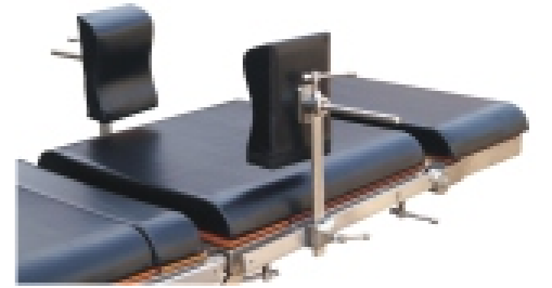
Adjustable padded side support