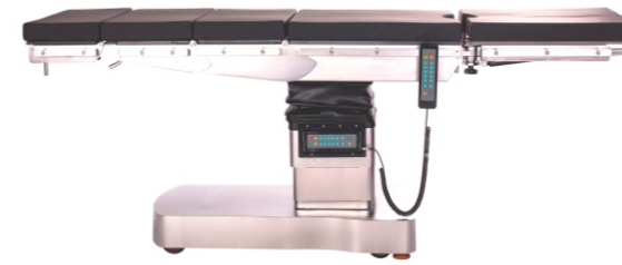
Minimum Height: 650mm