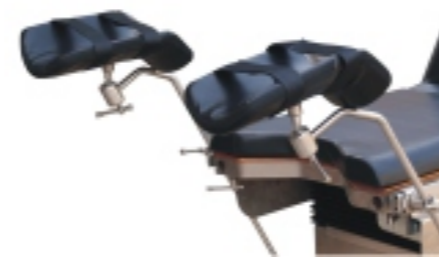
Anti static lithotomy crutches swiveling type with ball socket, leg strap & ss clamps