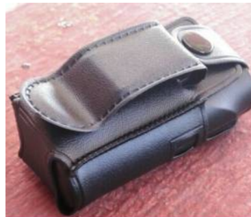
Leather Bag for A2TS Battery