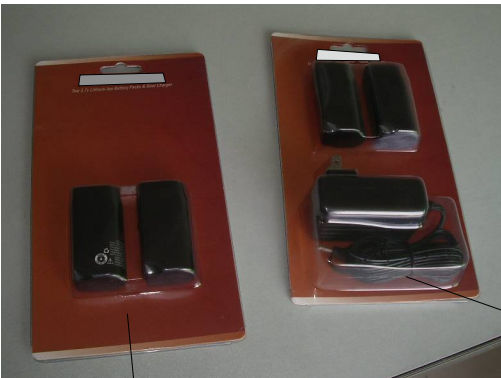
AC102-KT2 blister package, carton size 56*37.6*18CM, 25kits/ctn, 8Kg