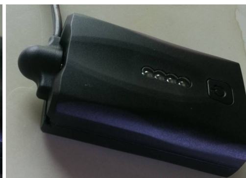
Plug Locking Design