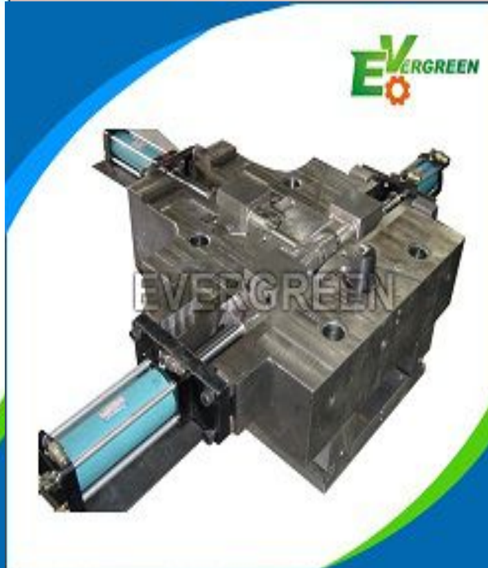
Ningbo EverGreen Machinery Co.,LIMITED