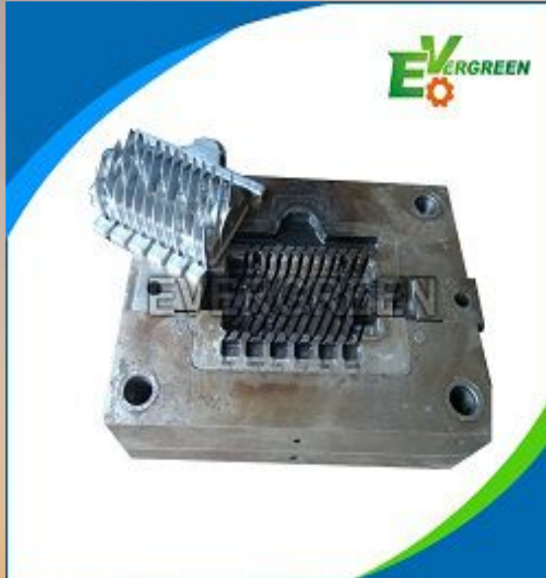
Ningbo EverGreen Machinery Co.,LIMITED