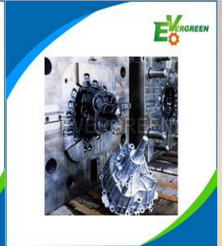
Ningbo EverGreen Machinery Co.,LIMITED