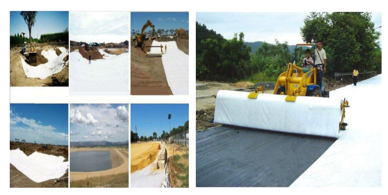
Part Three: The Application of non woven geotextile