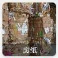
废纸 Waste Paper