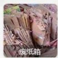
废纸箱 waste cardboard