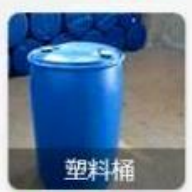
塑料桶 Plastic barrel