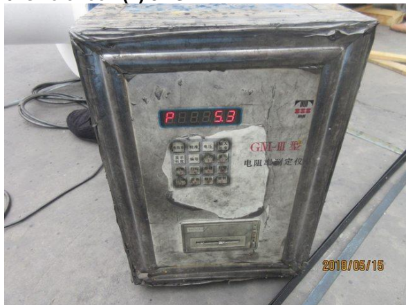
7. resistivity test (2).JPG