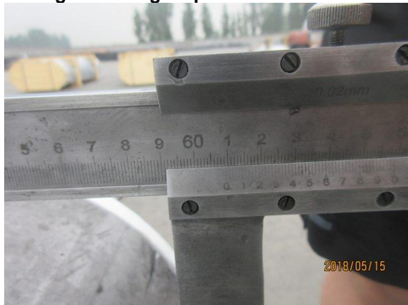
6. size check (2).JPG