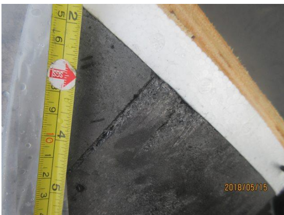
scuff mark on the surface-min.JPG