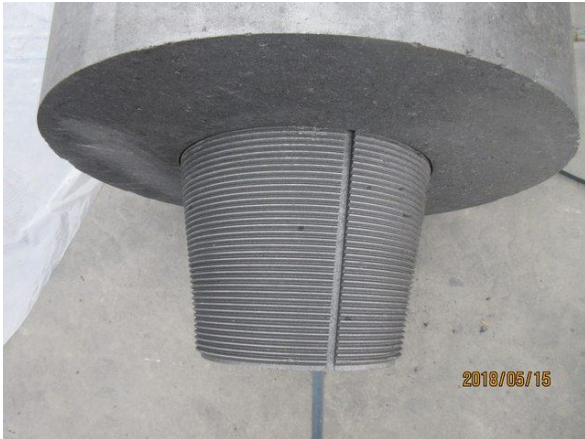
4. product view (3).JPG