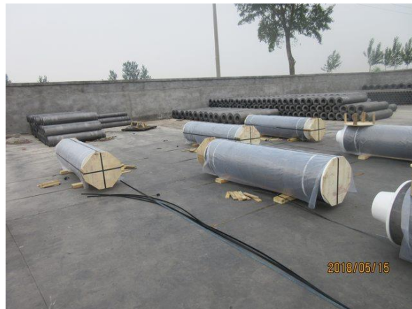
1. storage photo (2).JPG