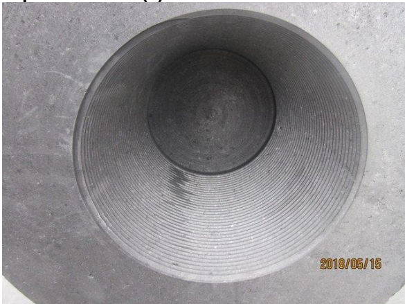
4. product view (5).JPG