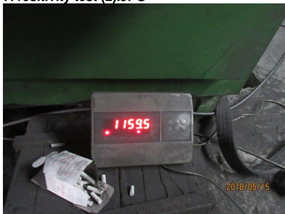
8. weight check (2).JPG