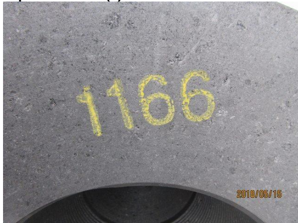
5. weight marking on product.JPG