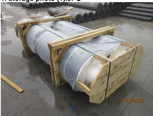
2. pallet packing view.JPG