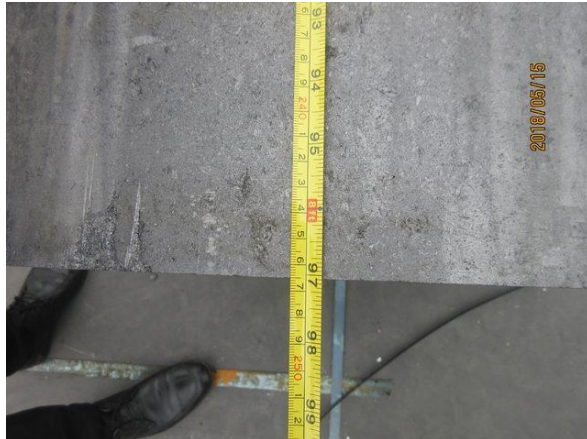
6. size check (4).JPG