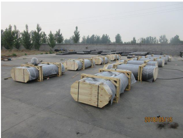
1. storage photo (1).JPG