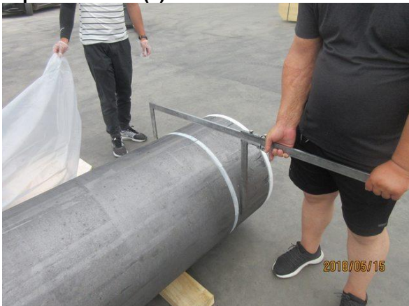
6. size check (1).JPG