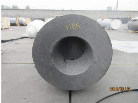
4. product view (4).JPG