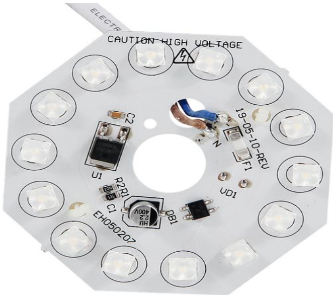
8W LED module entity diagram