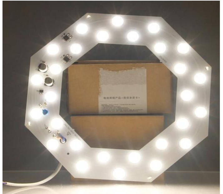
26W LED module lighting diagram