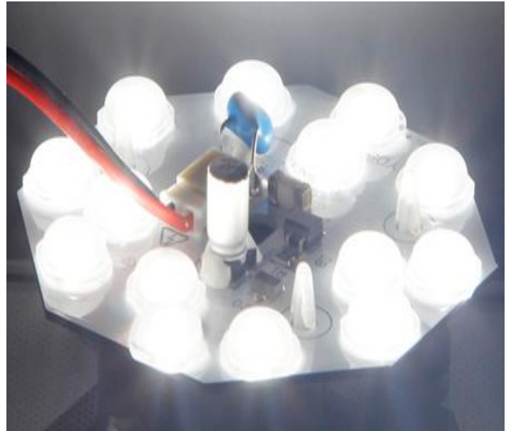
5W LED module lighting diagram