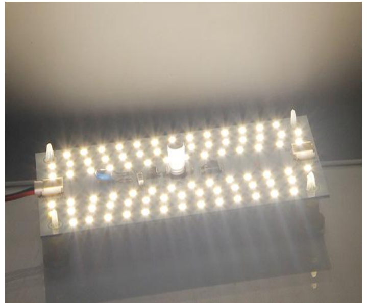
9W LED module lighting diagram