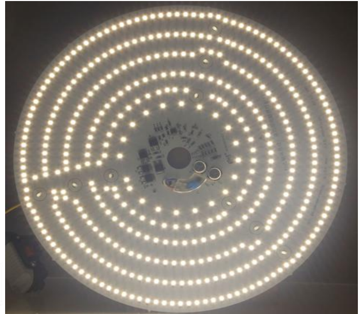
40W LED module lighting diagram