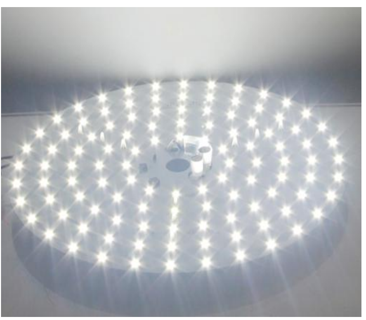
35W LED module lighting diagram