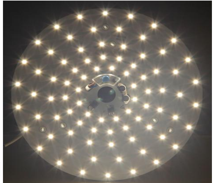
24W LED module lighting diagram