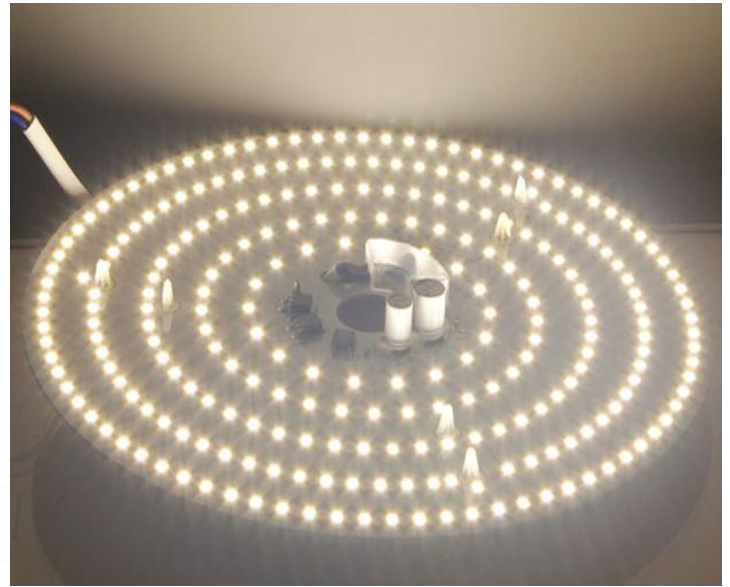
24W LED module lighting diagram