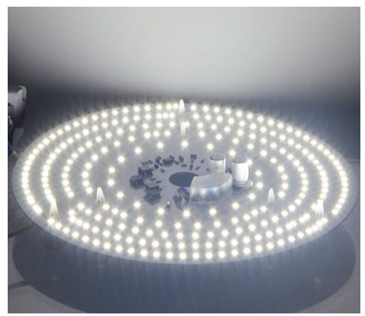
24W LED module lighting diagram