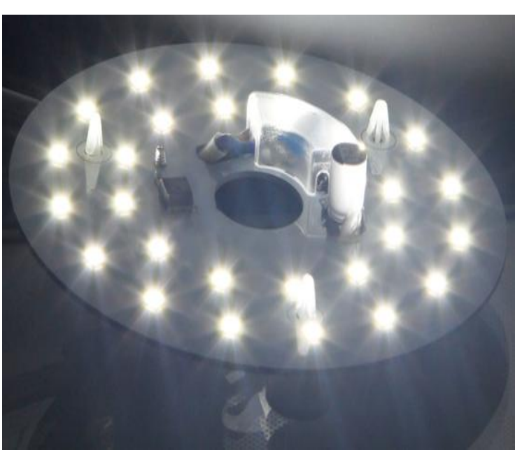
9W LED module lighting diagram