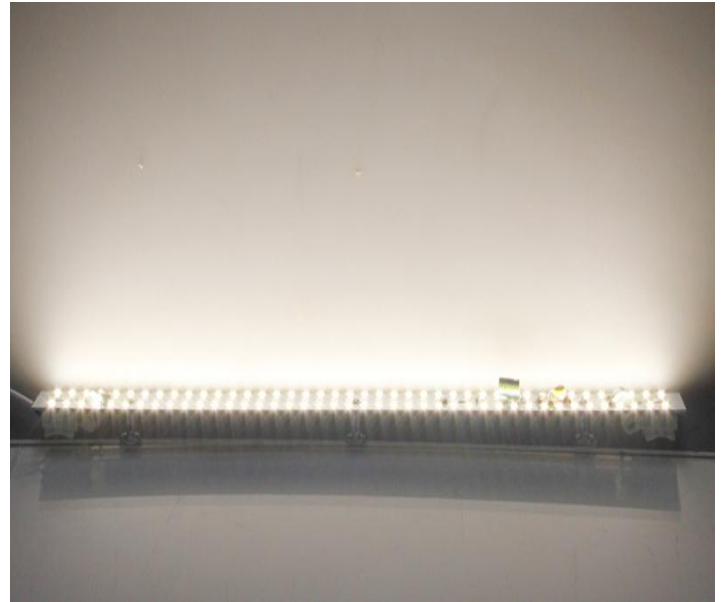
9W LED module lighting diagram