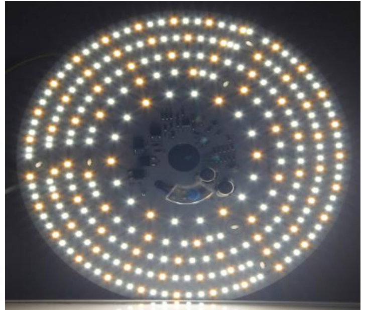
24W LED module lighting diagram