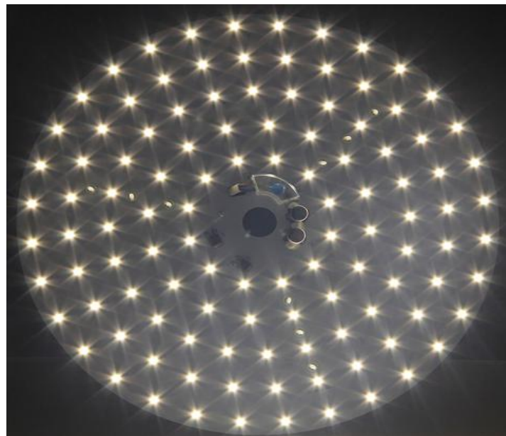
35W LED module lighting diagram