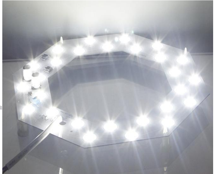
26W LED module lighting diagram