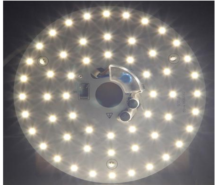
15W LED module lighting diagram