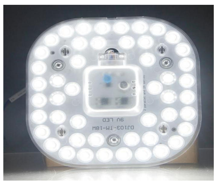
18W LED module lighting diagram