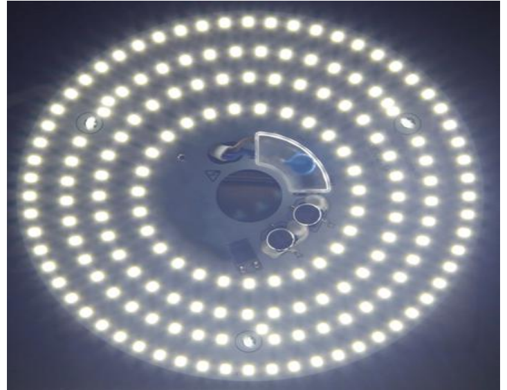
15W LED module lighting diagram