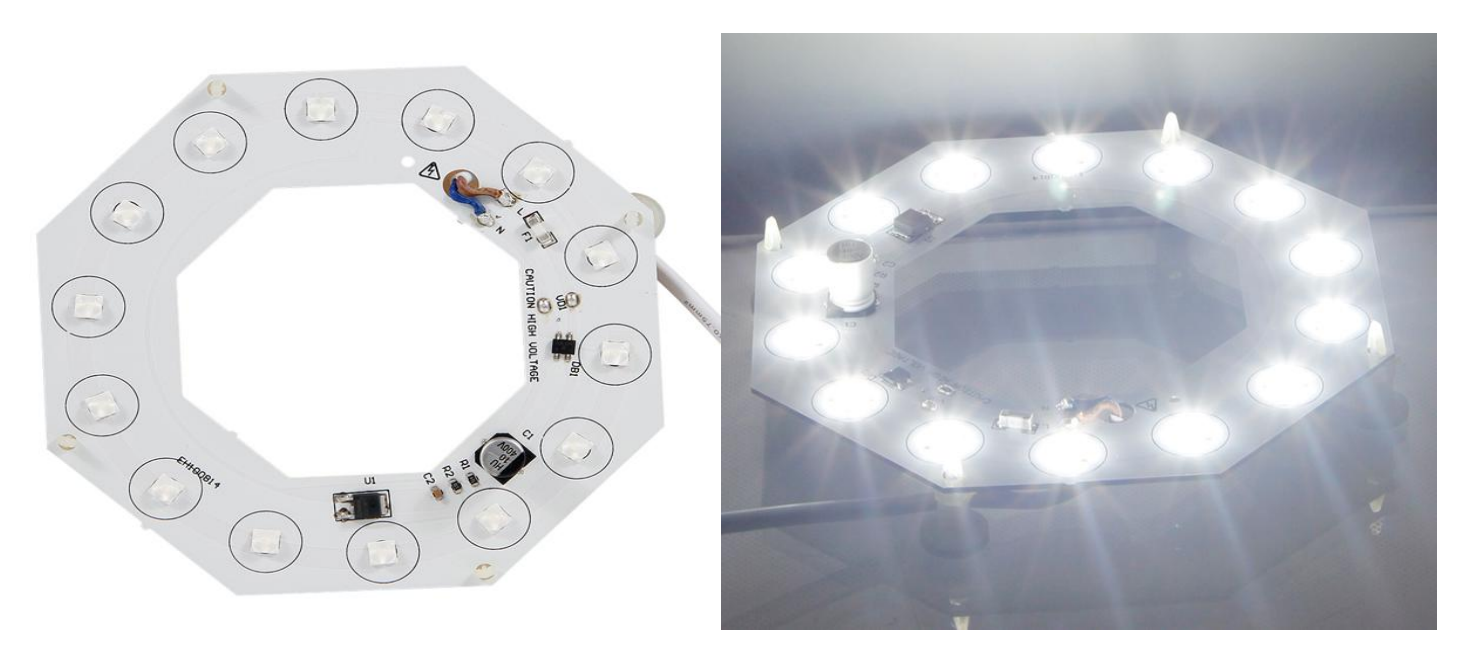
14W LED module entity diagram