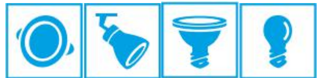
down light spot light par lamp bulb