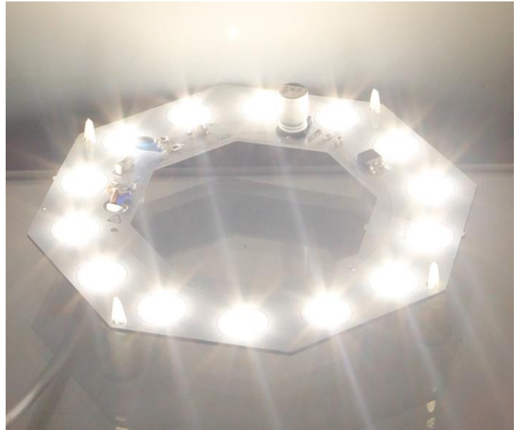
14W LED module lighting diagram