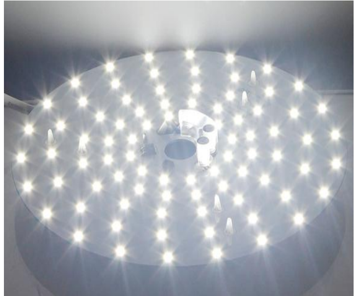
24W LED module lighting diagram