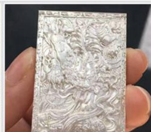
Silver medal relief