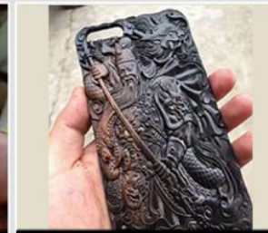
Mobile phone shell relief