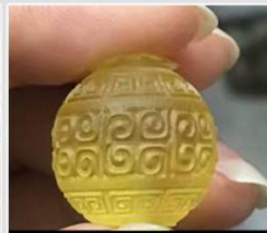
Honey wax beads