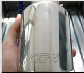
Car exhaust pipe logo