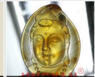
Honey Wax Guanyin