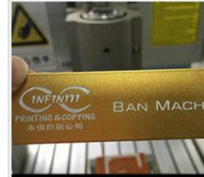
Aluminum alloy lettering