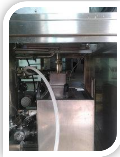
Latest Design Cleaning Tank