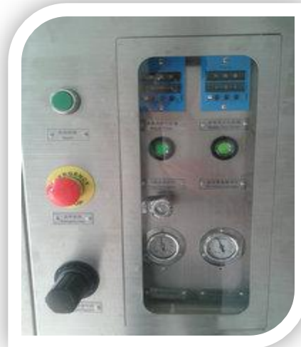
Press the start button