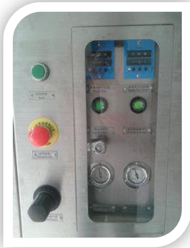
New Control Panel