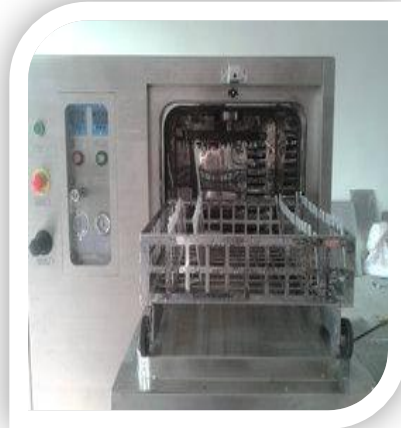
Put the items to be cleaned