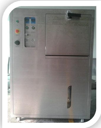
Adjust the cleaning pressure