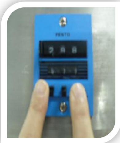
Set drying time