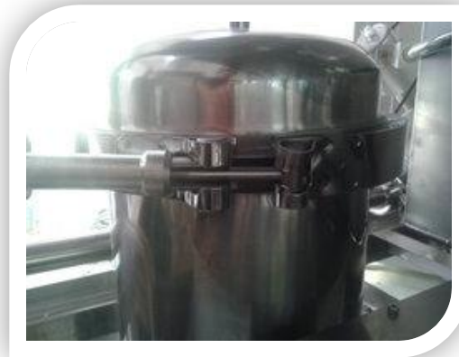
Larger Capacity Filtration System