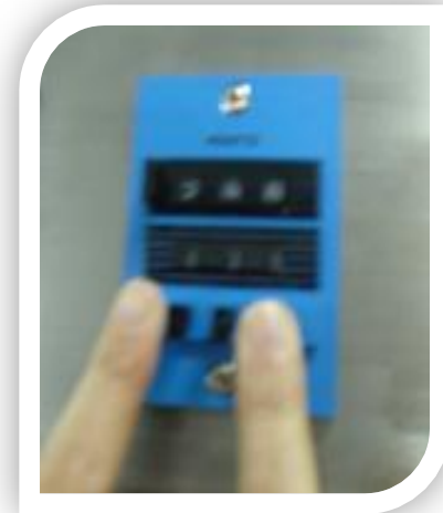
Set cleaning time