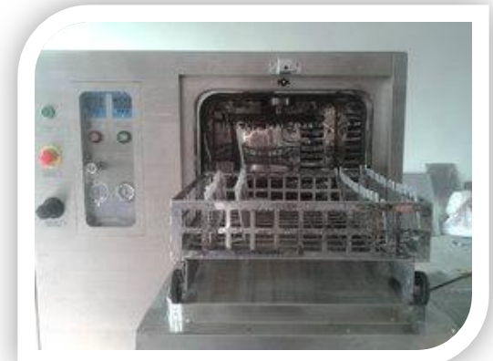
More Reasonable Layout Cleaning Room