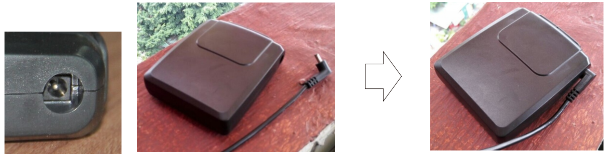
Backwards DC connector with plug holding design to make perfect connection