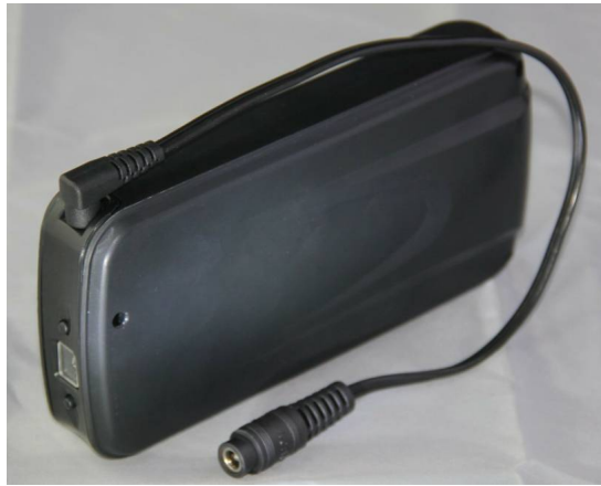
Ac801 battery with extension cable for better connection