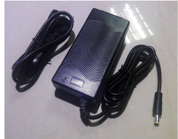
P1985 Charger 31*57*120mm