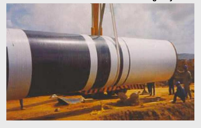
POLYKEN Plant Coating System