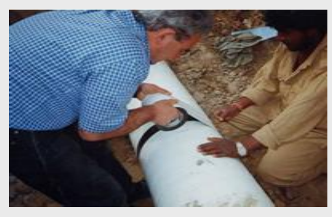
POLYKEN Coating System