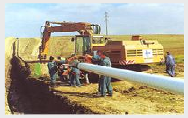
POLYKEN Reconditioning coatings