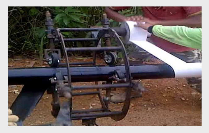
POLYKEN Pipeline accessory products

THE HIGHEST QUALITY ANTI-CORROSION COATING SYSTEMS FOR UNDERGROUND PIPELINES