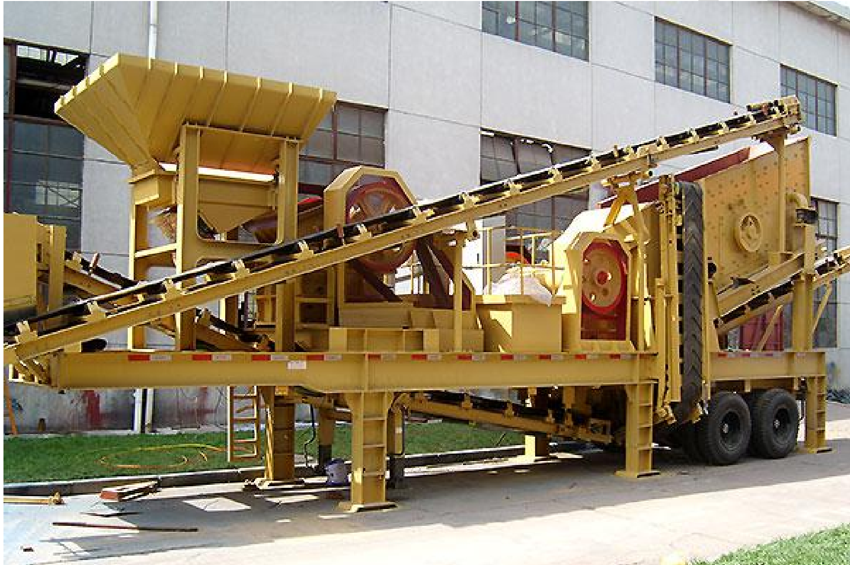
Highlights of Mobile jaw crusher plant /mobile jaw crusher

Website: www.heavyequipmentchina.com also www.zzjiangtai.com