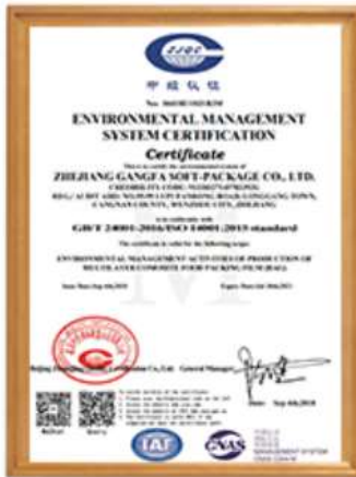
[ QMS ]