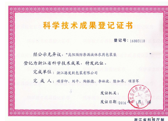
High blocking leakage liquid bag