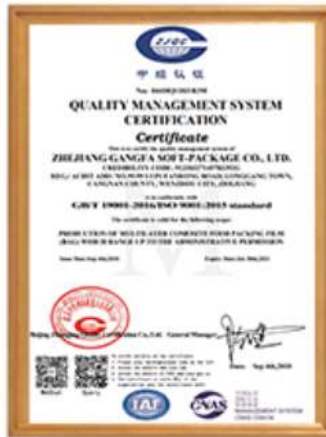
[ OHSMS ]