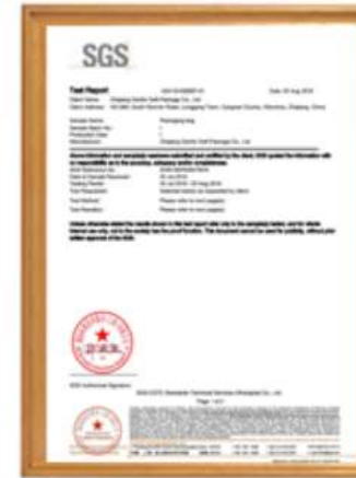
[ Microbiologic Analysis ]