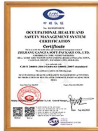
[ EMS ]