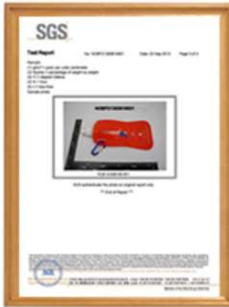
[ SGS ]