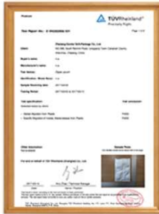
[ EU ]