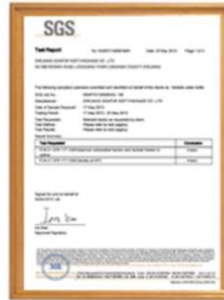
[ FDA ]