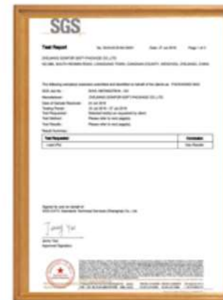
[ Analysis of Lead ]