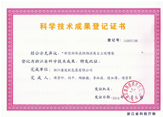
The new environmental protection high block wine stand up nozzle bag