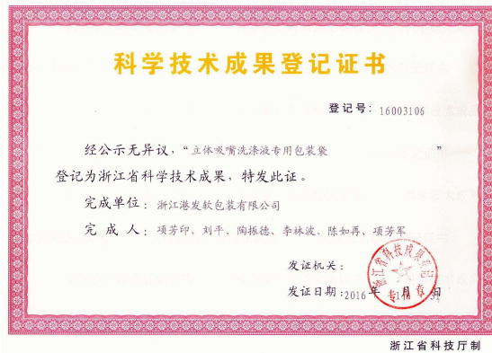
Stand up nozzle laundry detergent bags