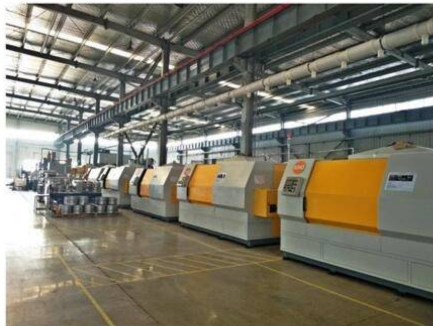
焊接设备 WELDING EQUIPMENT