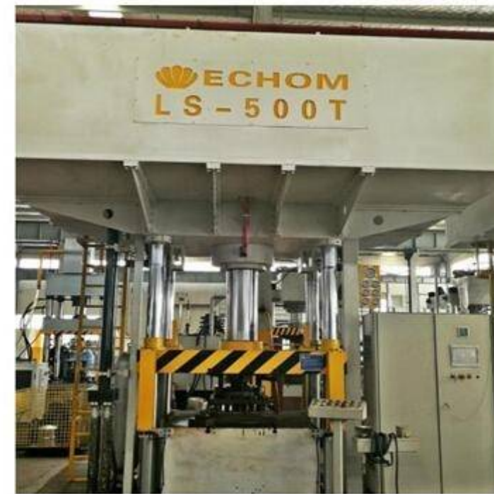
拉伸设备 STRETCHING EQUIPMENT