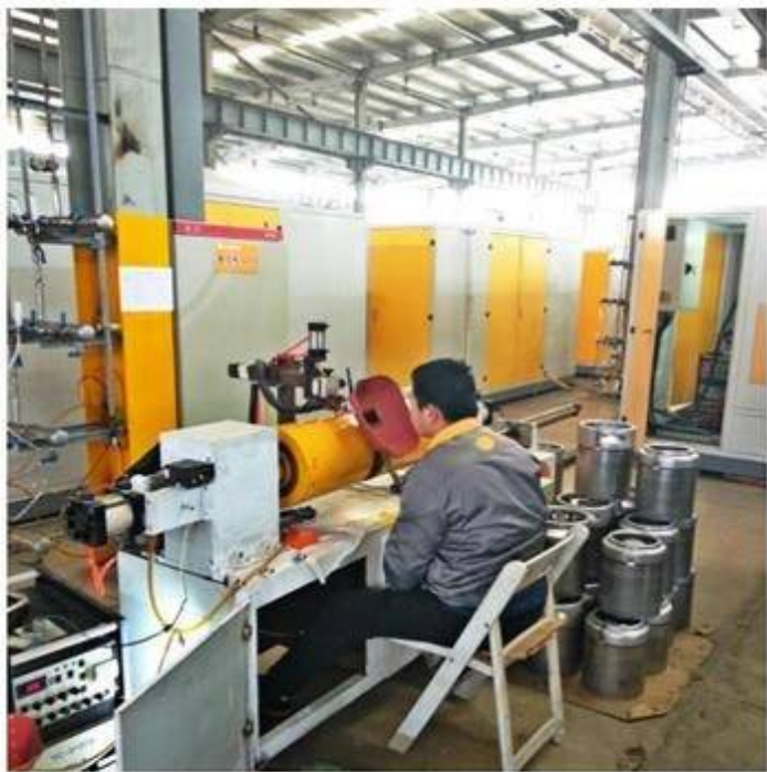
焊接设备 WELDING EQUIPMENT