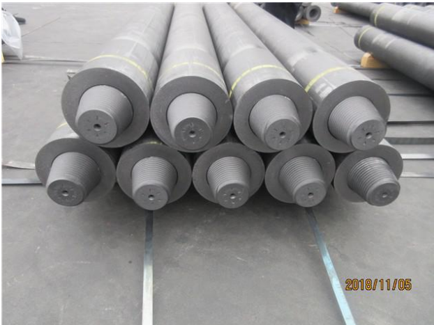
05. product view (2) 2018/11/05