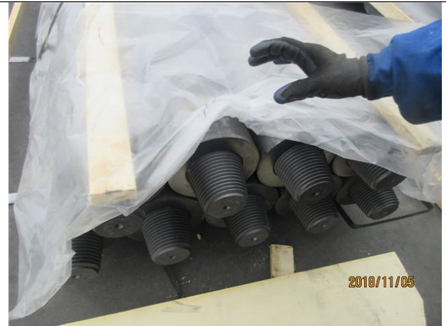
Replace Nipple Photos(1)