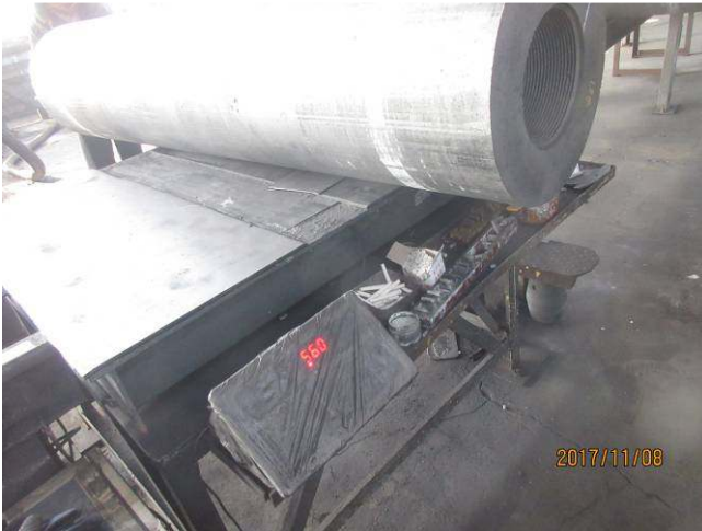
10.weight check (1).JPG