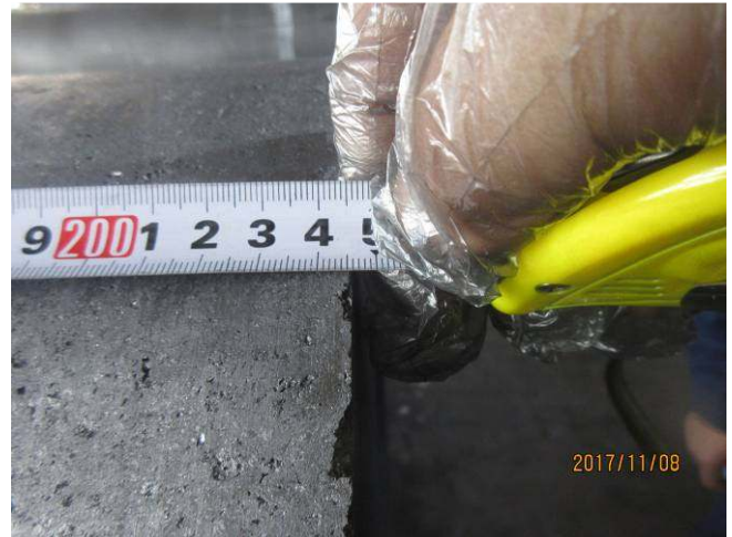
9.size check (2).JPG