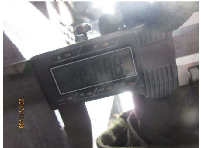
9.size check (4).JPG