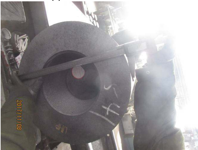
9.size check (3).JPG