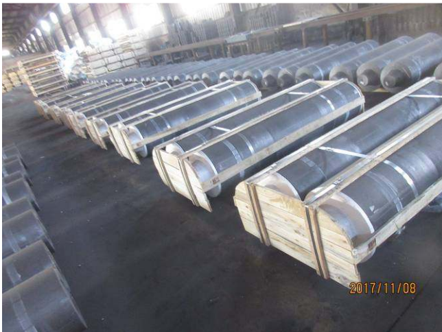
1.pallet stack (1).JPG