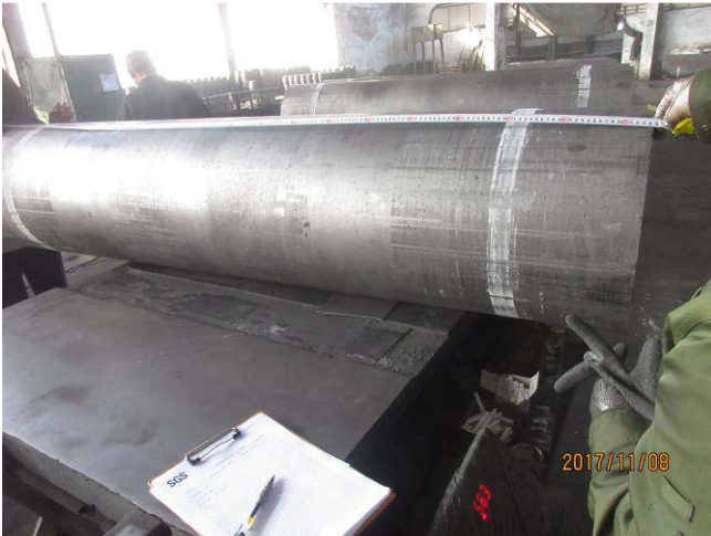
9.size check (1).JPG