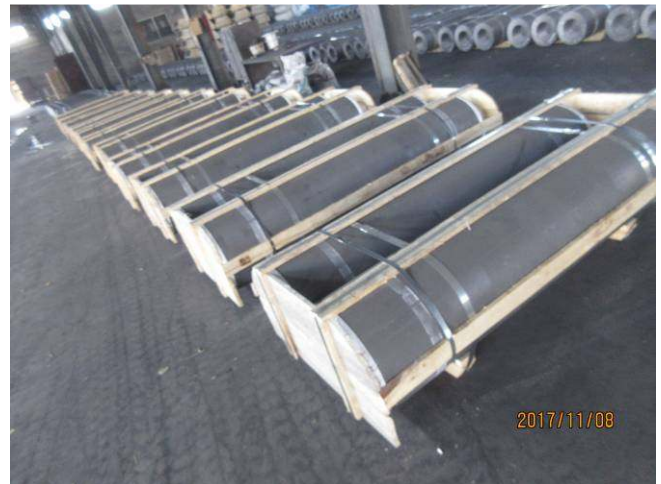
1.pallet stack (2).JPG