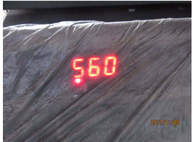
10.weight check (2).JPG