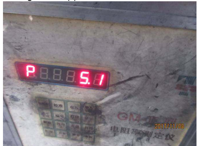
11.resistance check (2).JPG