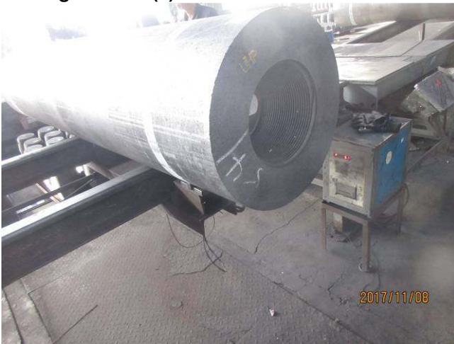
11.resistance check (1).JPG