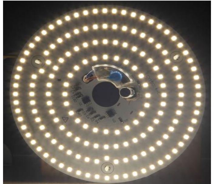
15W LED module lighting diagram