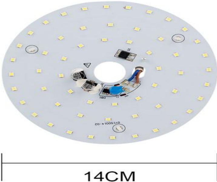
15W LED module entity diagram