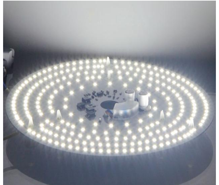
24W LED module lighting diagram