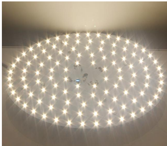
50W LED module lighting diagram