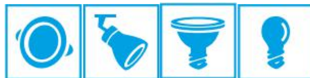
down light spot light par lamp bulb