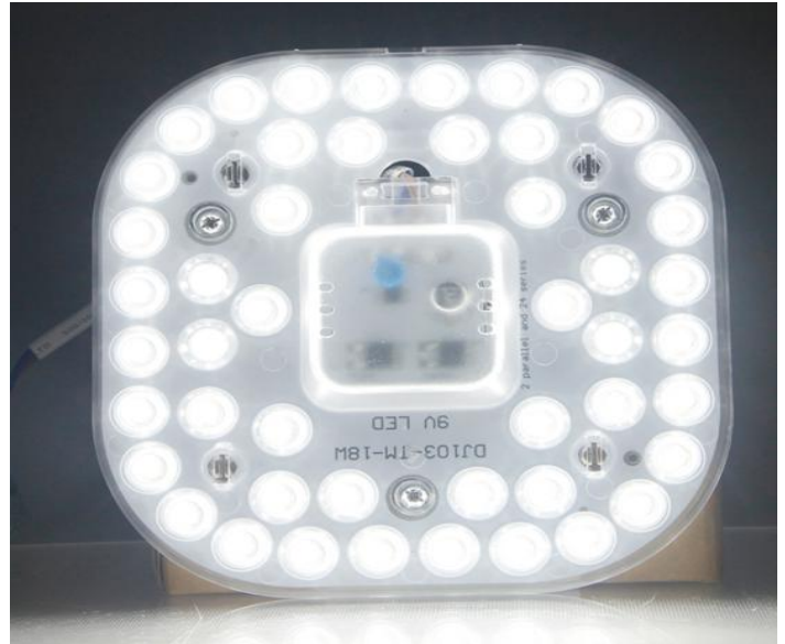
18W LED module lighting diagram