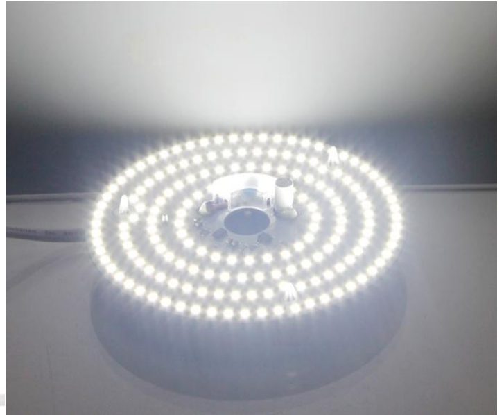
15W LED module lighting diagram