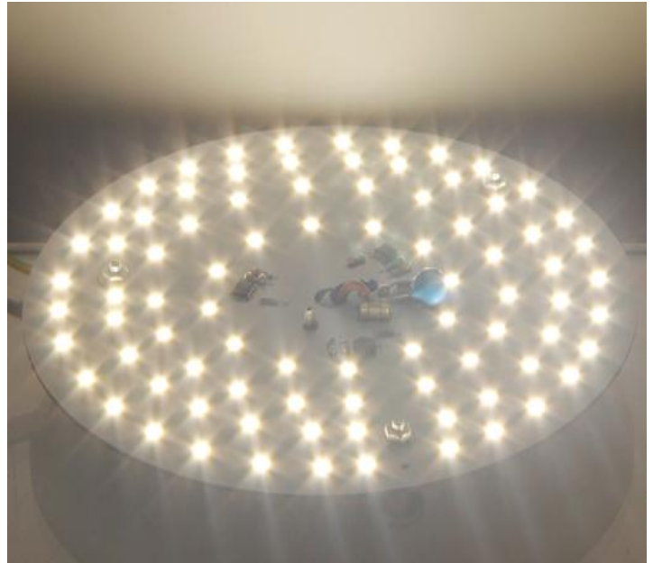
25W LED module lighting diagram