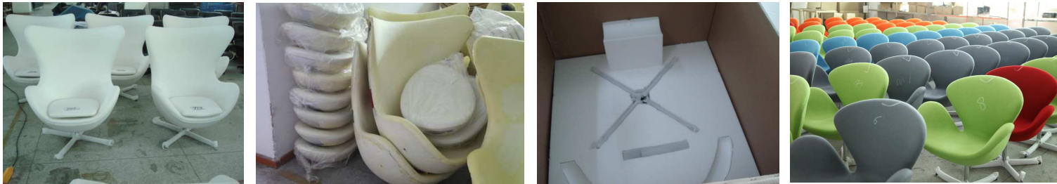
Yadea furniture, 3 rounds inspection of each work flow sequence